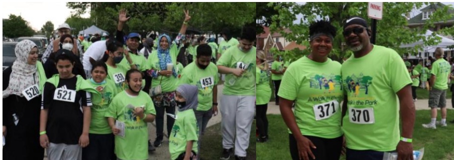
Photos from 2022 Hamtramck Health Hike hosted for the community to lead drug free lifestyles.

Find more information on: HamtramckDrugFree.com