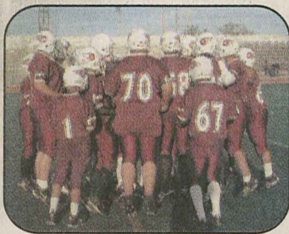
Hamtramck High School students had their moment in the sun last Friday for the school's annual Homecoming Parade. Unfortunately, the Cosmos football team lost, 32-0.

It's the annual fall rite of passage with all the trappings: each graduating class vying for attention. The Cosmos' Homecoming also lives up to its namesake, Cosmos being short for cosmopolitan. The student body is one of the area's most ethnically diverse, with kids coming from Bangladesh, Poland, Bosnia, Yemen and elsewhere.