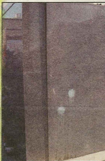
"Pope Park" starting to show its age.

In a recent meeting held April 14, 2005, the group discussed possibilities to raise $125,000 to $175,000---the estimated cost to repair the deteriorating